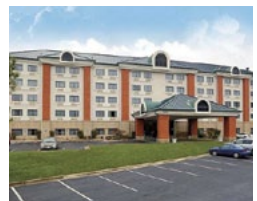
HOLIDAY INN EXPRESS