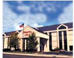
HAMPTON INN - 76 STRIP